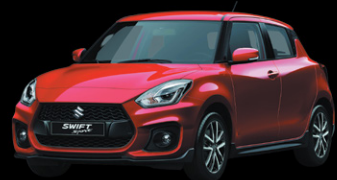
Burning Red Metallic