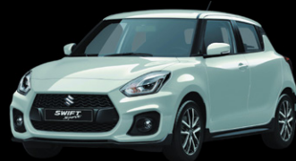
Pearl Pure White