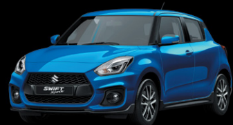
Speedy Blue Metallic