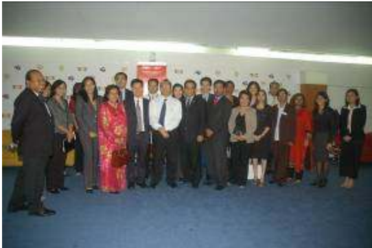
One for the album

On 5 July 2007, MIA organised a working visit with other representatives from professional accountancy bodies such as ACCA, CIMA, CPA Australia, and MICPA to Media Prima Berhad in Petaling Jaya. The visit was aimed at understanding the role of the media and learning how best the accountancy profession can assist the media in disseminating critical business information to the public.