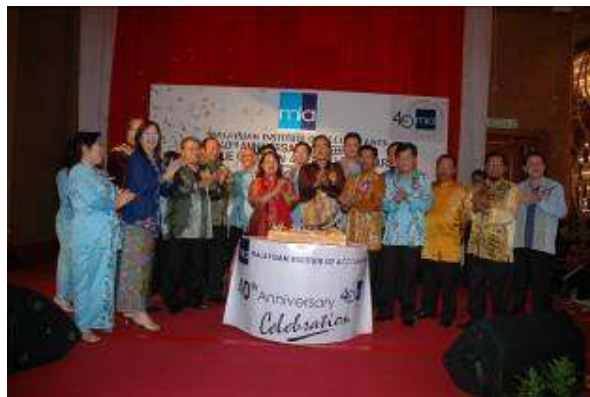
Celebrating 40 years of MIA in Negeri di Bawah Bayu