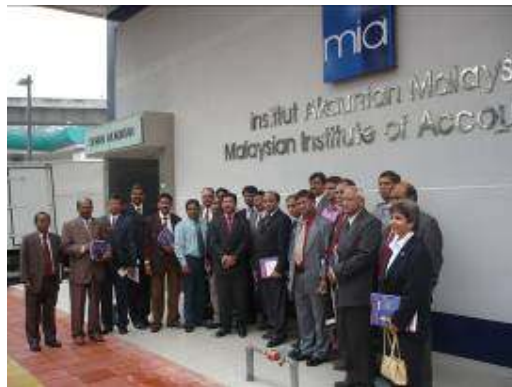
The delegation from ICWAI with MIA representatives