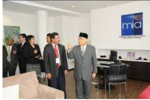
A tour of the MIA office in Penang