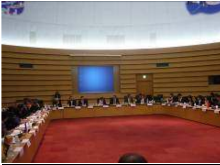
The CAPA meeting in progress

MIA sent a delegation to the 17 th Conference of the Confederation of Asian and Pacific Accountant (CAPA) which was held from 3-5 October 2007 in Osaka, Japan. The Conference was hosted by the Japanese Institute of Certified Public Accountants (JICPA) at the Osaka International Convention Centre. In conjunction with the conference, the 13 th CAPA meeting was also held.