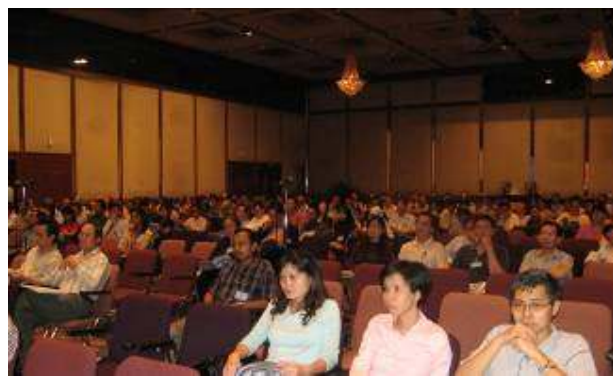
Members at the AGM