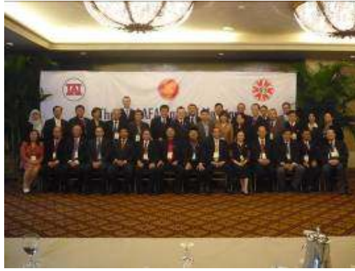
The delegates at the 91 st AFA Council Meeting