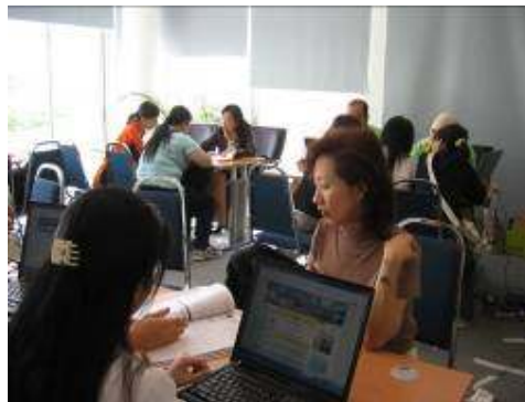
Representatives from MIA assisting taxpayers on filling in forms

In an effort to encourage better tax compliance among taxpayers of the current tax legislation, Lembaga Hasil Dalam Negeri Malaysia (LHDNM) in collaboration with the Malaysian Institute of Accountants (MIA) Penang Branch organised a free Tax Payers Awareness Day on 11 April 2008 at the Penang Branch new office. LHDNM officers and representatives from Ernst & Young, DeloitteKassimChan, KPMG and PricewaterhouseCoopers, were present throughout the day to answer and clarify taxpayers' enquiries. Many had questions about filling out forms, declaring income and calculating their taxes. This event also served as a platform for promoting e-Filing System.