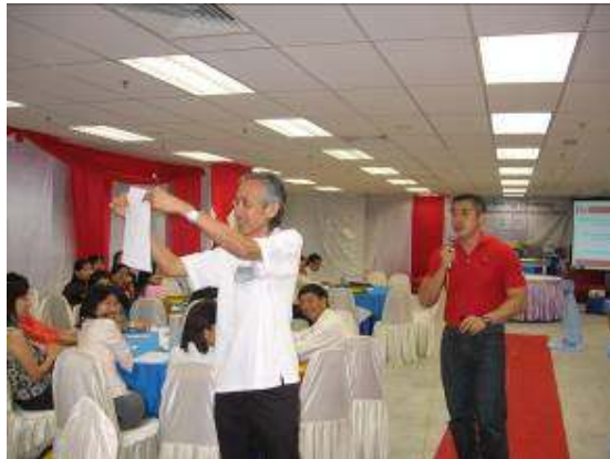
Participants having fun at the Fitness talk

In conjunction with the official opening of Penang branch new office on 28 April 2008, a series of four free talks on retirement planning, financial management, property investment and fitness were held for the public on the next day. A total of some 250 people benefited from the talks.