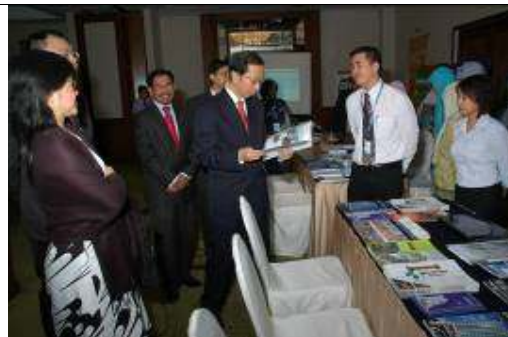
Visiting the exhibitor booths