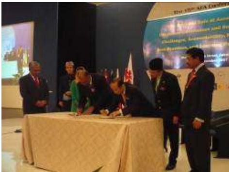
The MIA delegation at the opening ceremony of the conference