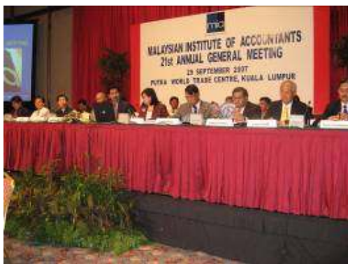
Council members at the AGM