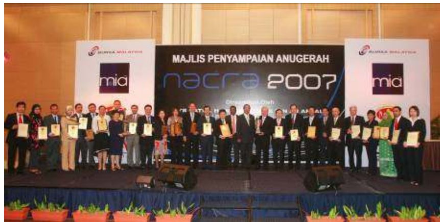
All the winners of the NACRA 2007 awards