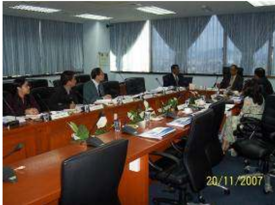
The meeting in progress