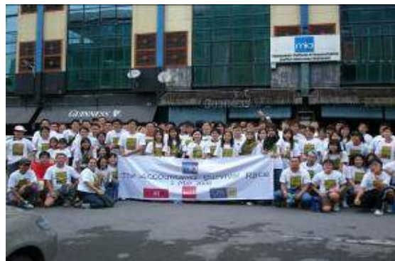
Participants in the Accountants Survival Race 2008

With the support of ACCA, CIMA and CPA Australia, the MIA Sarawak Branch organised The Accountants Survival race on 1 May 2008. The race was meant to test mental and physical skills of participants in tackling back to basic tasks outside the boardroom in a fun-filled manner.