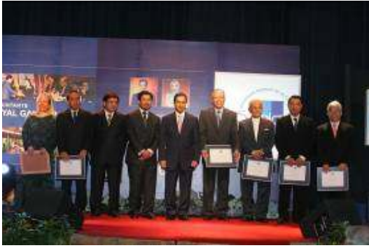
Honouring the past MIA Presidents