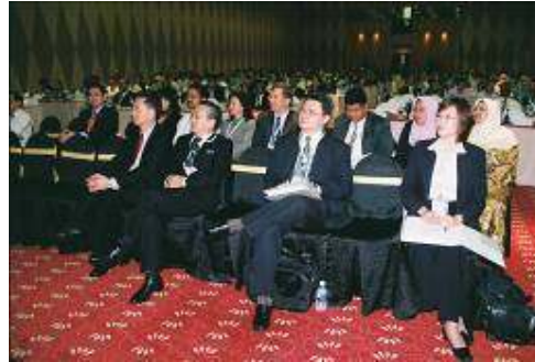
Participants at RC 2008