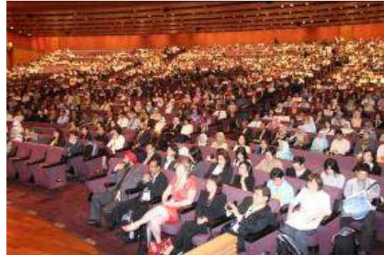
The participants at NAC 2007