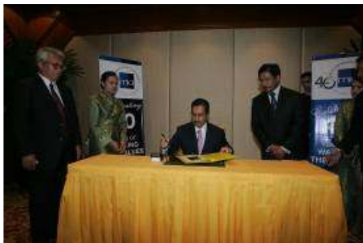
His Majesty signs the guest book upon arriving at the anniversary dinner

On 7 November 2008, MIA organised its 40 th Anniversary Royal Gala Dinner themed "MIA: 40 years of walking the values" at the Shangri-La Hotel. His Majesty The Yang di-Pertuan Agong Al-Wathiqu Billah Tuanku Mizan Zainal Abidin Ibni Al-Marhum Sultan Mahmud Al-Muktafi Billah Shah who graced the occasion with his royal presence commended the Malaysian Institute of Accountants (MIA) for continuing to be the focal point of the accountancy profession in Malaysia.