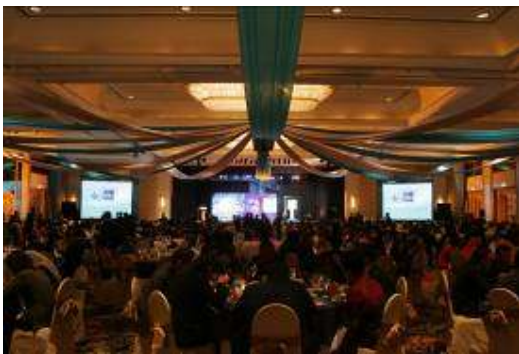
The guests at the dinner