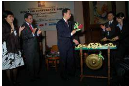
YAB Tan Sri Dr Koh launches the conference

The Penang Branch of MIA organised the Business Conference 2007 at the Traders Hotel in Penang on 29 November 2007. Themed “Driving Innovation”, the conference attracted 230 participants comprising CEOs, CFOs, directors, managers and accountants. The conference was launched by then Penang Chief YAB Minister Tan Sri Dr Koh Tsu Koon.