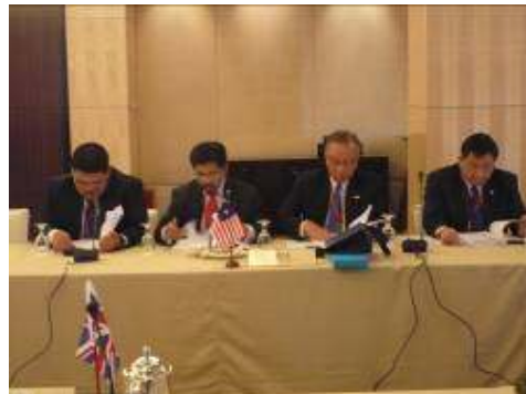
Caption the MIA delegation at the 91 st AFA Council Meeting