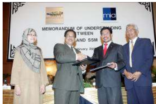
Exchanging the MoU