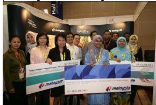
Winners of the lucky draws held at the NAC 2007 exhibition