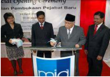
The official opening by TYT Tun Dato' Seri utama (Dr.) Haji Abdul Rahman