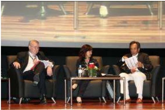
One of the NAC sessions in progress