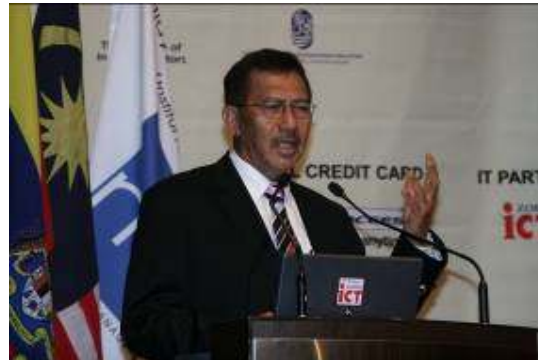
Dato' Seri Azmi Khalid, then Minister of Natural Resources and Environment presenting on Climate Change