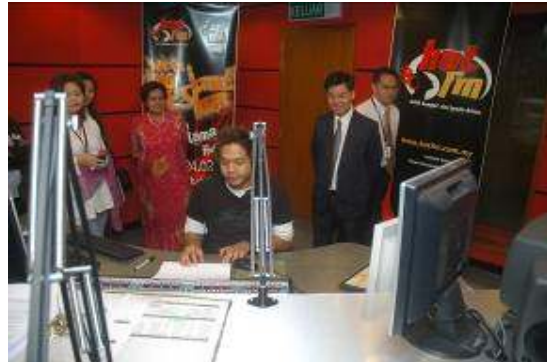
Understanding the operations at a radio station