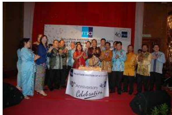
Celebrating 40 years of MIA in Negeri di Bawah Bayu